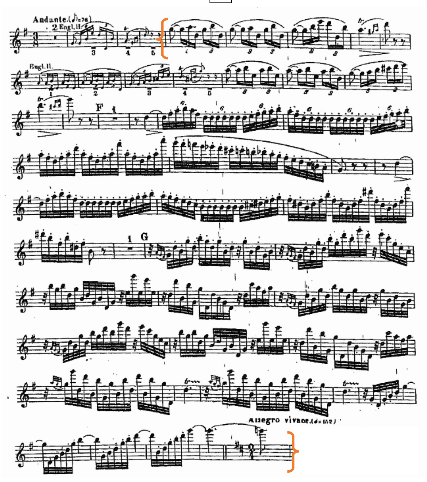
Page 1 of 2

Bar 6 until first bar in Allegro Vivace J=69